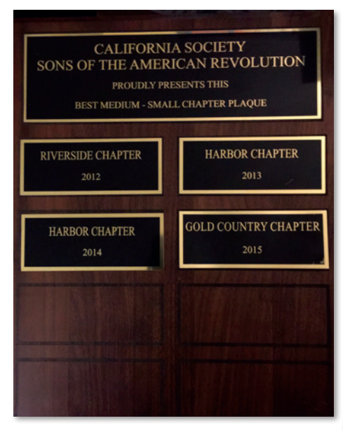
The plaque and certificates given to Gold Country Chapter at the 2016 California SAR Spring Meeting for the Best Chapter Contest, Medium-Small Category.