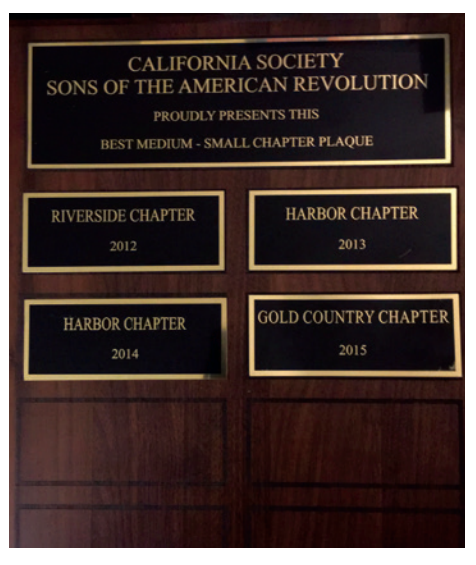
Chapter Awards and Honors at the State Meeting on page 5