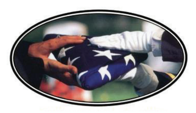
In Memoriam A Tribute to our Absent Compatriots