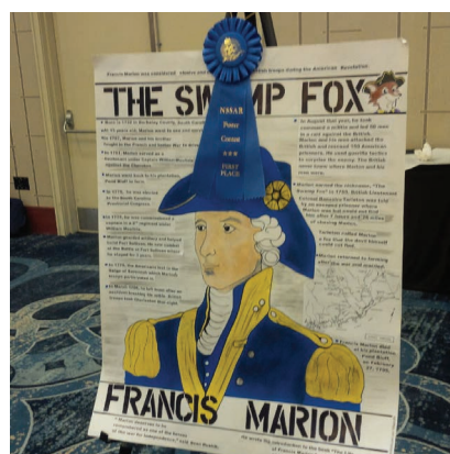
First Place Poster at the 2014 SAR National Congress came from South Carolina