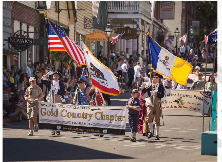
Gold Country SAR Color Guard marching in the Constitution Day Parade in Nevada City.