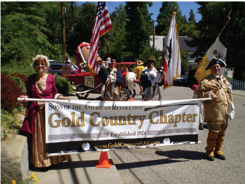
Gold Country SAR Color Guard preparing to march in the 4 th of July Parade in Nevada City.